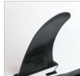
Canoe Surfboard Fins in...