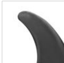
Simple Surfboard Fin Lon...