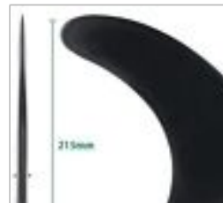
Universal SUP Fin 9 Inch...